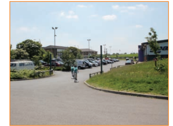
Main Car Park

Please park responsibly in the Goals car park or overflow car park in the Minet Country Park next door. BEWARE: Height restriction barriers might be in place for early arrivals. Please park only within the marked bays. Larger vehicles and motor homes should park along Springfield Road. PLEASE DO NOT park within the entrance gate or along the verges near the entrance as this blocks access for emergency vehicles and the Goals car park. Hillingdon Council and Goals do not allow parking overnight in either car park.