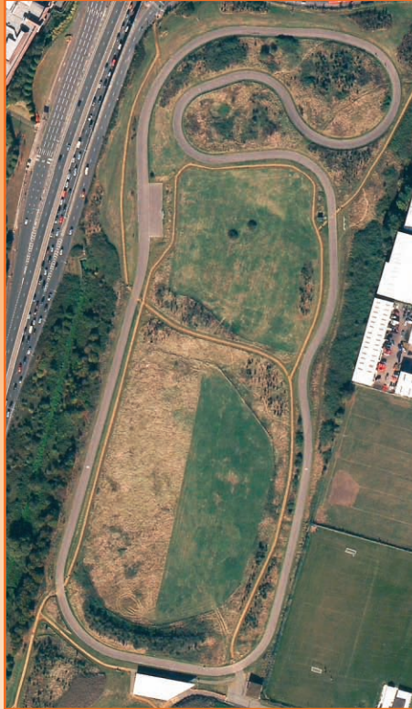
Hillingdon Cycle Circuit Springfield Road, Hayes, Middlesex, UB4 0LP