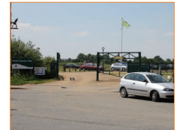
Overflow Car Park